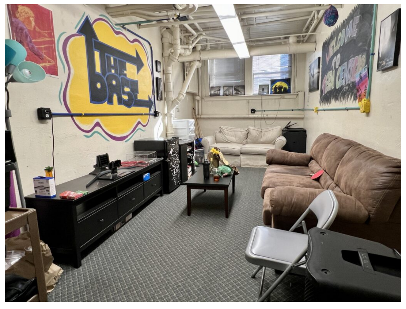
The small space that has served as the teen center at the Elmwood Community Center.

Like what you see here? <u>Click here to subscribe to We-Ha's newsletter</u> so you'll always be in the know about what's happening in West Hartford! Click the blue button below to become a supporter of We-Ha.com and our efforts to continue producing quality journalism.