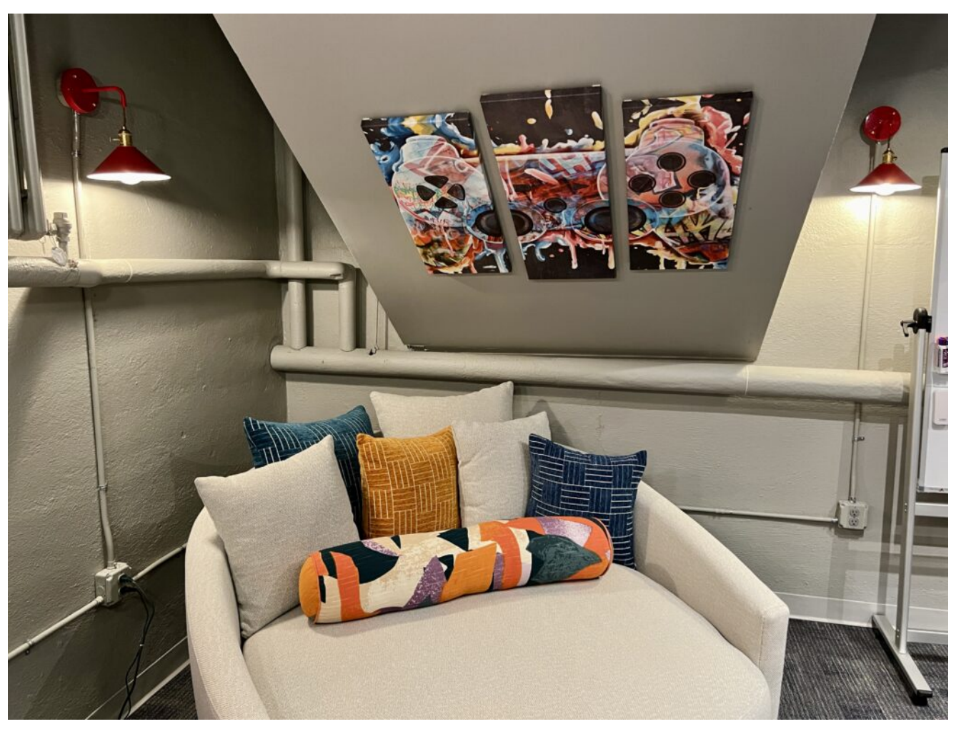
A 'Merry Makeover' by Camden Grace at 'The Base,' West Hartford's teen center at the Elmwood Community Center, was revealed on Dec. 13, 2023.